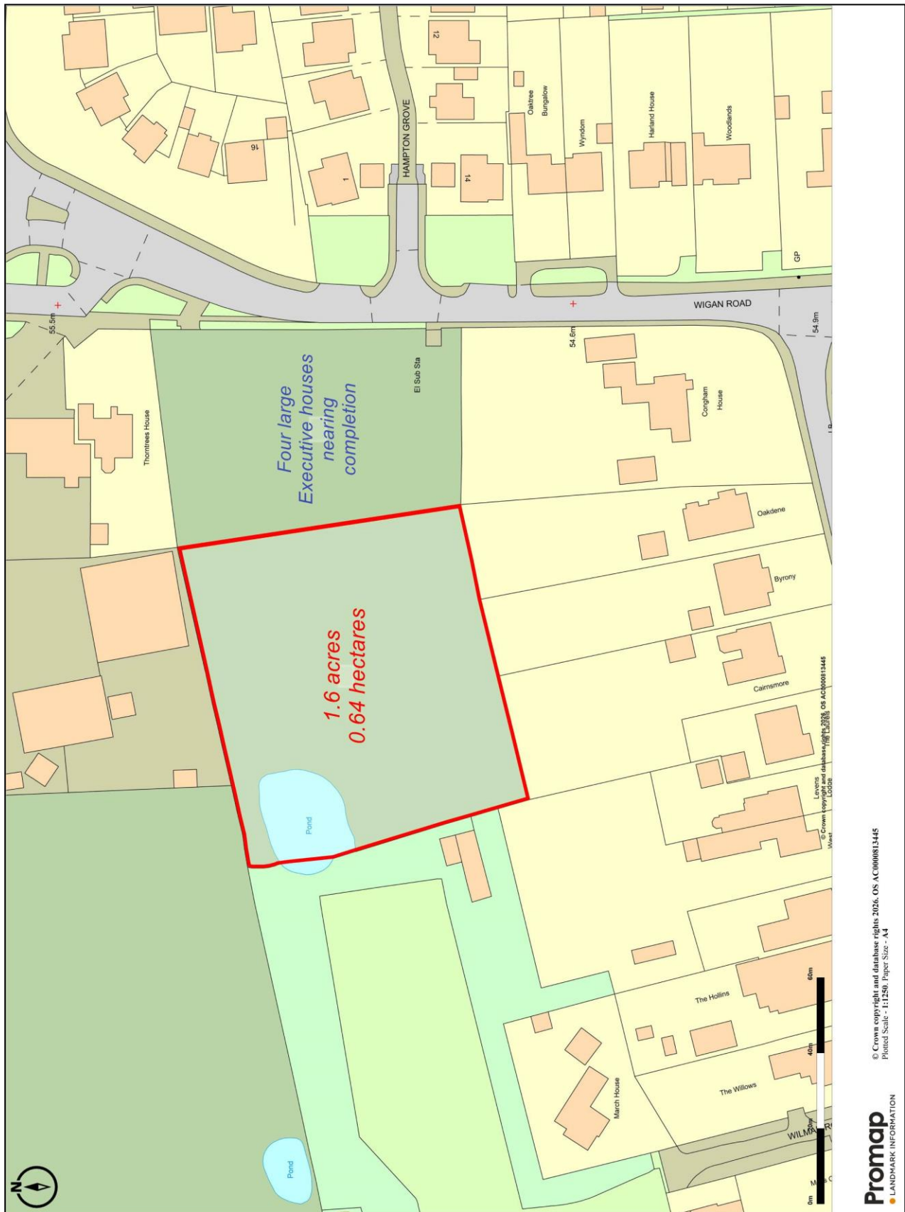
Residential Development Land adjoining Thorntree House, Wigan Road, Cuerden, Leyland, PR25 5SB